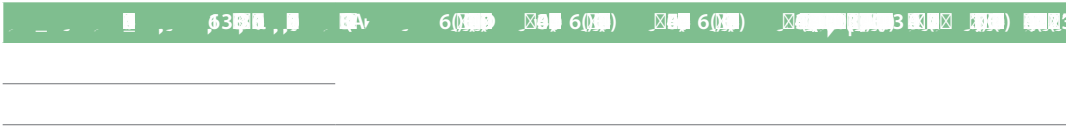
Exhibit 5: Cronbach's Alpha Reliability Coefficient and Principal Components Analysis of the Items in the TIMSS 2011 Students Value Mathematics Scale, Eighth Grade