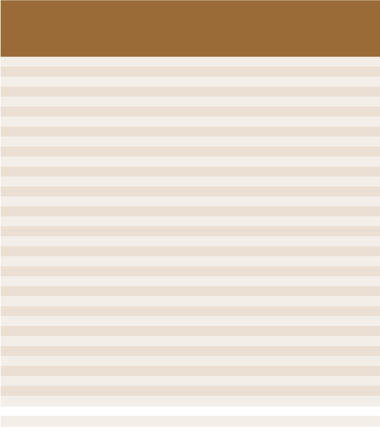
Exhibit 8.4: Index of Students' Reading Self Concept (SRSC) by Gender