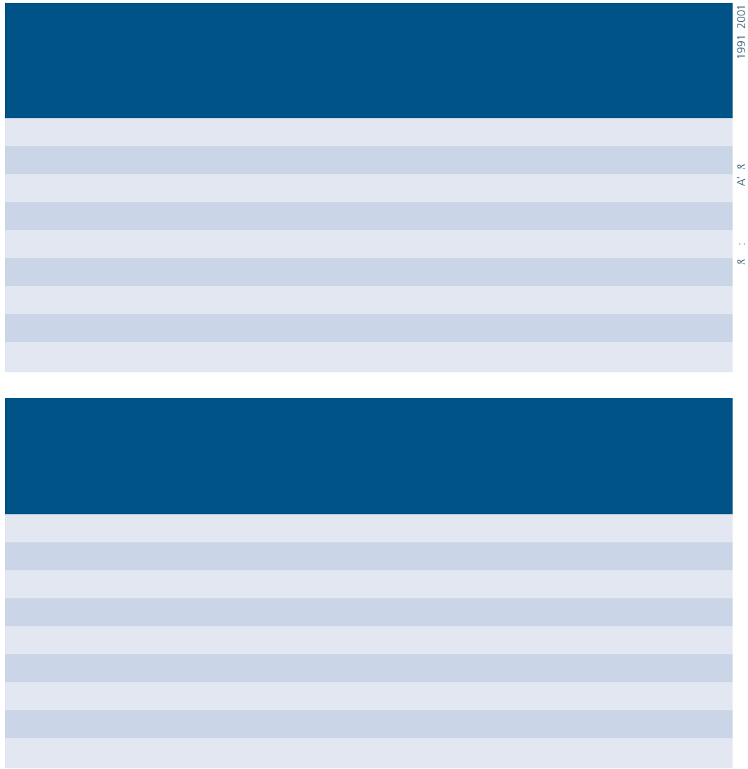
Exhibit 4.1: Trends in Students Reading Textbooks in Reading or Language Class